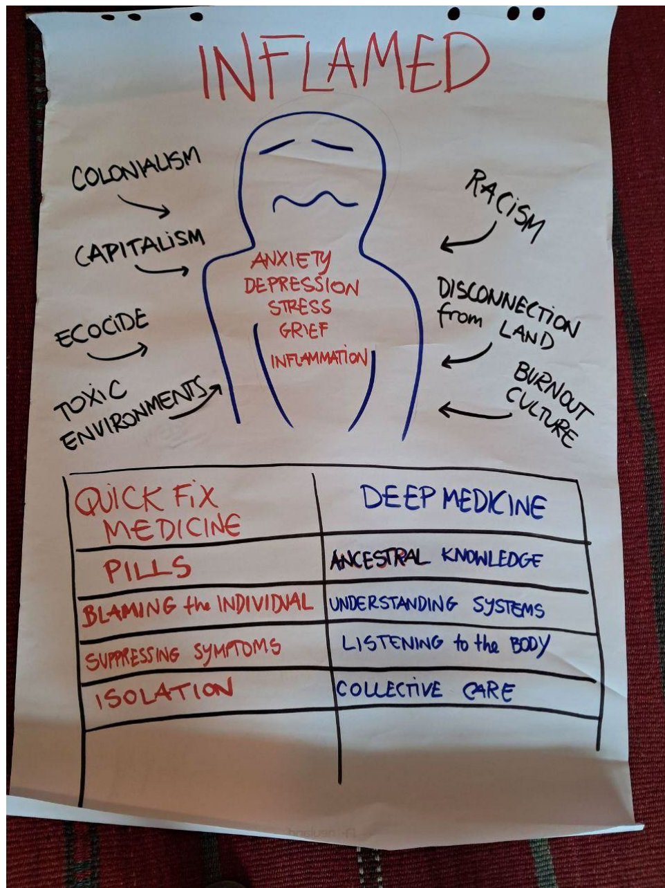
Flipchart created by Collective Care Berlin